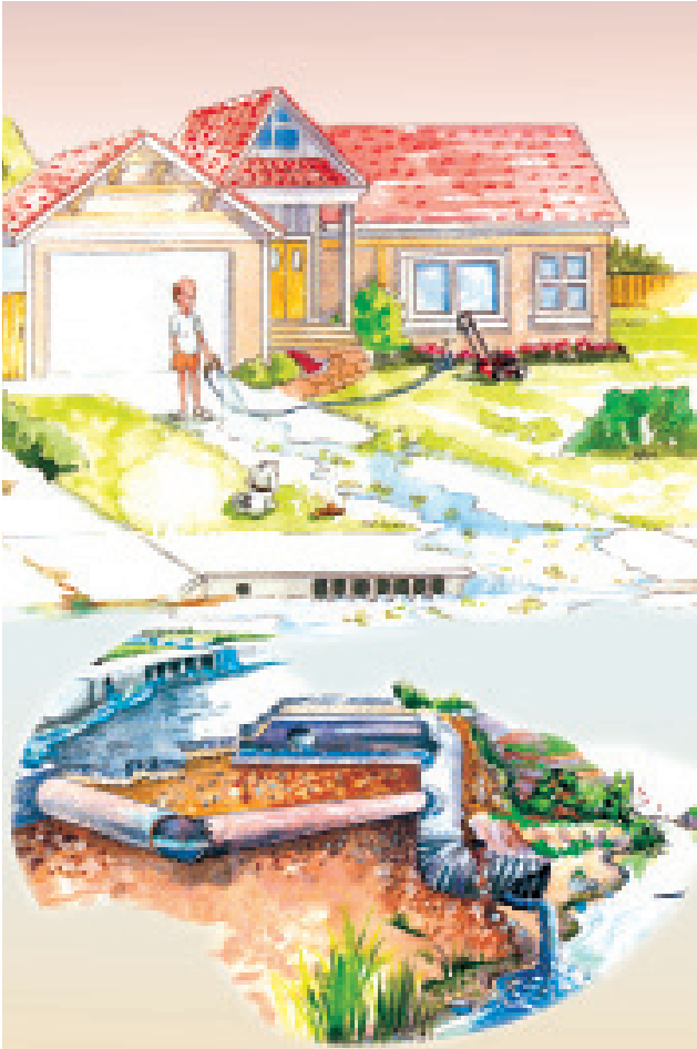
1) Wasting water on driveway; 2) Polluted water in storm drain; 3) Pet waste on grass; 4) Polluted water in stream.